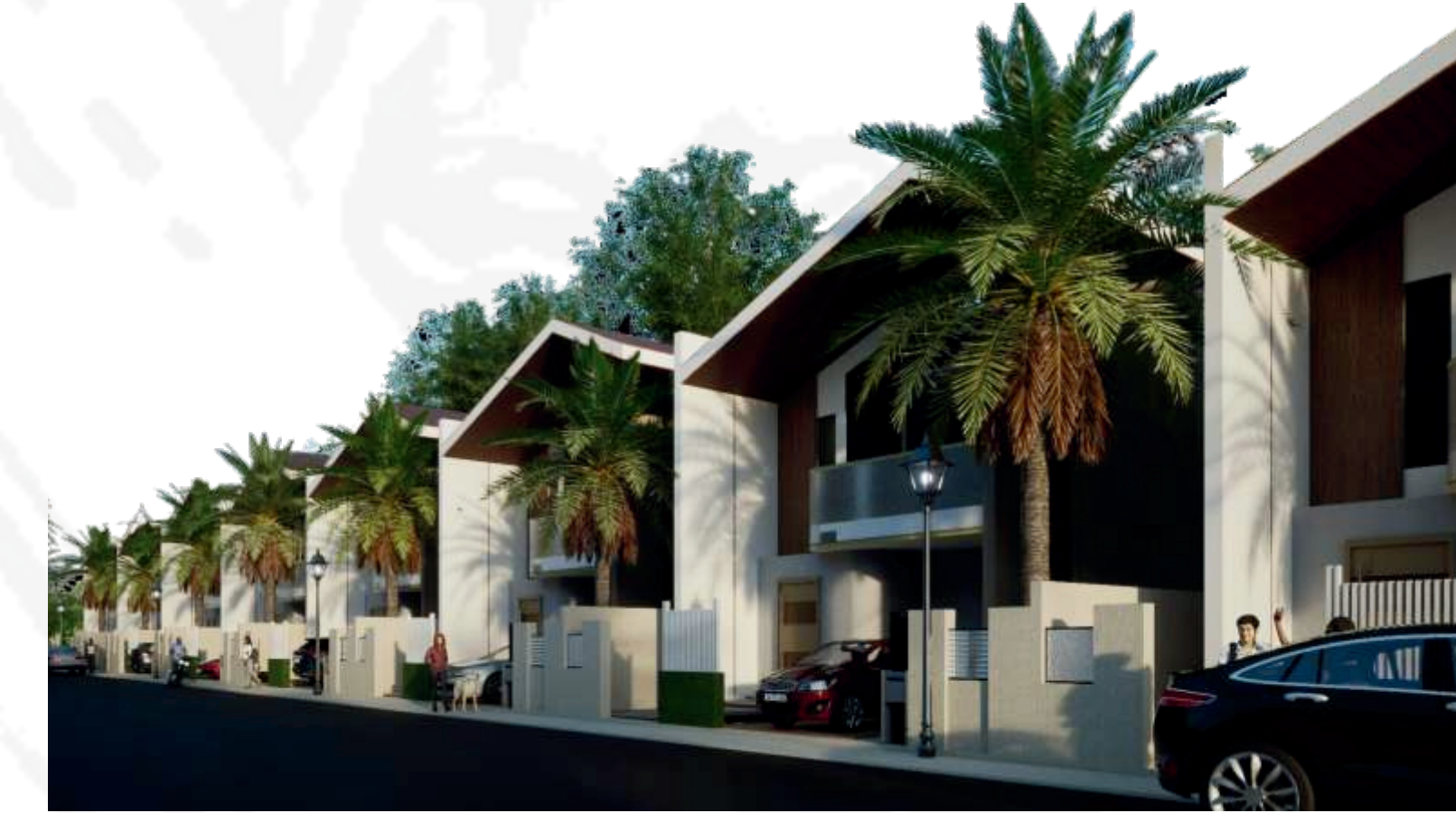
PREMIUM RESIDENTIAL PLOTTED COMMUNITY @ VEMPADU, ELURU